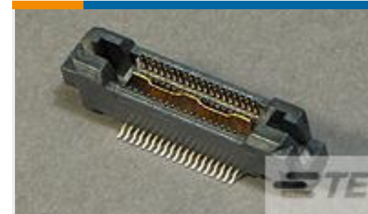
TE Part # 5767118-1 MICT,PLG,038,ASY,.025,TAPE CAP