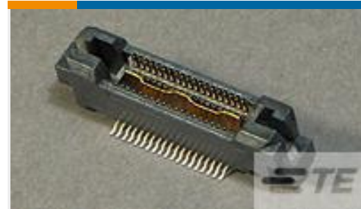
TE Part # 5767116-1 MICT,260PLG,038,ASY,.025,AUPLT