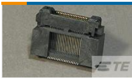
TE Part # 5767025-1 MICTOR .707 PLUG ASSY, 38 POS.