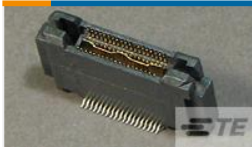
TE Part # 5767082-1 MICT,495,PLUG,038,PDNI,BARBLES