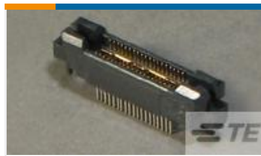
TE Part # 5767039-1 MICTOR,RA PLUG,038,.093PCB,ASY