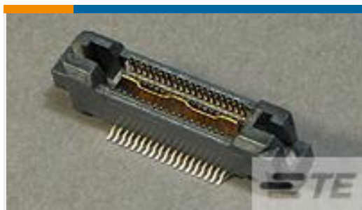
TE Part # 5767118-8 MICT,PLG,038,ASY,.025,TAPE PKG