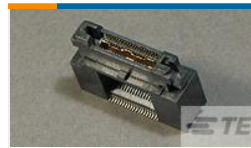
TE Part # 5767042-1 MICT,738PLUG,038,ASSY,.025,EXT