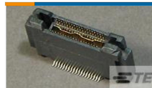
TE Part # 5767120-1 MICT,495PLG,038,ASY,.025,AUPLT