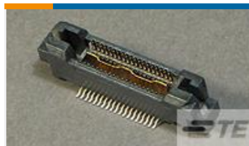
TE Part # 5767119-8 MICT,PLG,038,ASY,.025,TAPE PKG