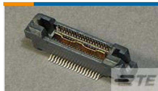
TE Part # 5767119-1 MICT,PLG,038,ASY,.025,TAPE PKG