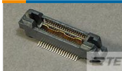
TE Part # 5767117-1 MICT,260,PLG,038,ASY,.025,PDNI